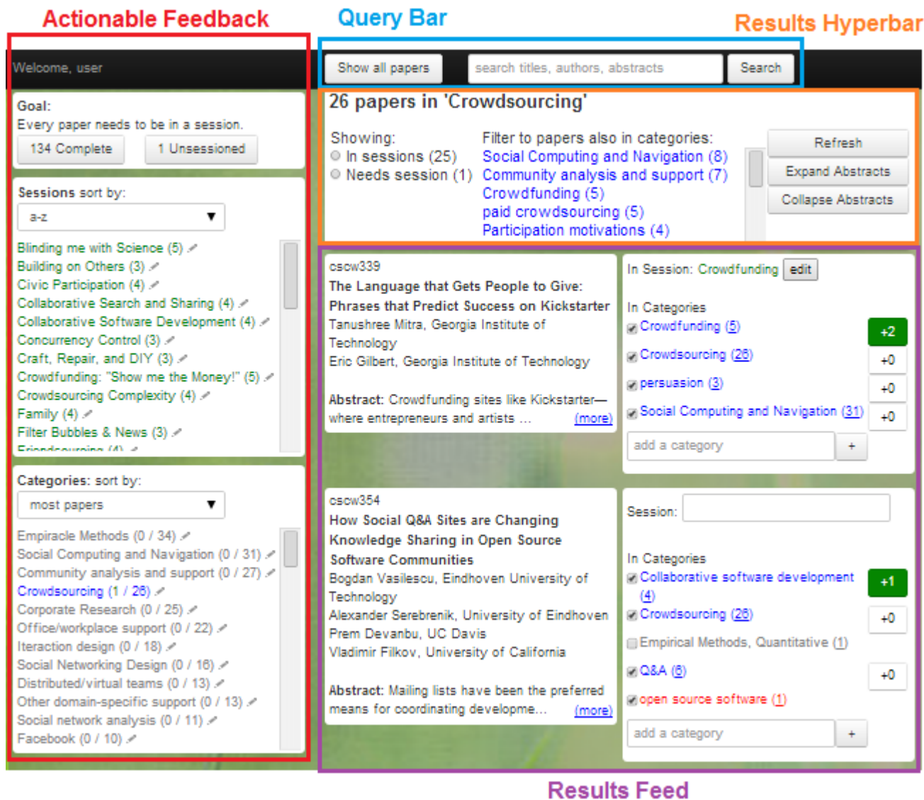
Figure 1. Frenzy interface, highlighting 4 sections: actionable feedback, query bar, results hyperbar, and results feed.

The left panel of Frenzy displays the actionable feedback . In both stages of Frenzy (meta-data elicitation and constraint satisfaction) there are two goals for users to achieve as a group. For example, in the meta-data elicitation stage one of the goals is: “Every category must have at least two papers in it (No singleton categories.)” Instead of instructing users how to achieve this goal, Frenzy provides two types of feedback on progress towards that goal that users can easily take action on (hence the name actionable feedback.) One type of actionable feedback for this goal is the list of categories, with the number of papers in that category in parenthesis. Any categories with only one paper are displayed in red text, indicating a problem. Users can then click on that category to see what paper is in it, and either